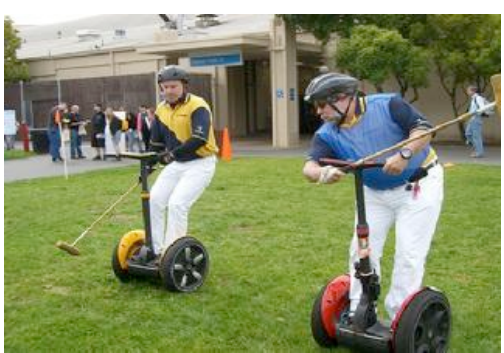
Billionaire Segway Founder Has A Bad Day